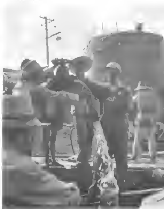
Loading ammonia water directly into transport boats.